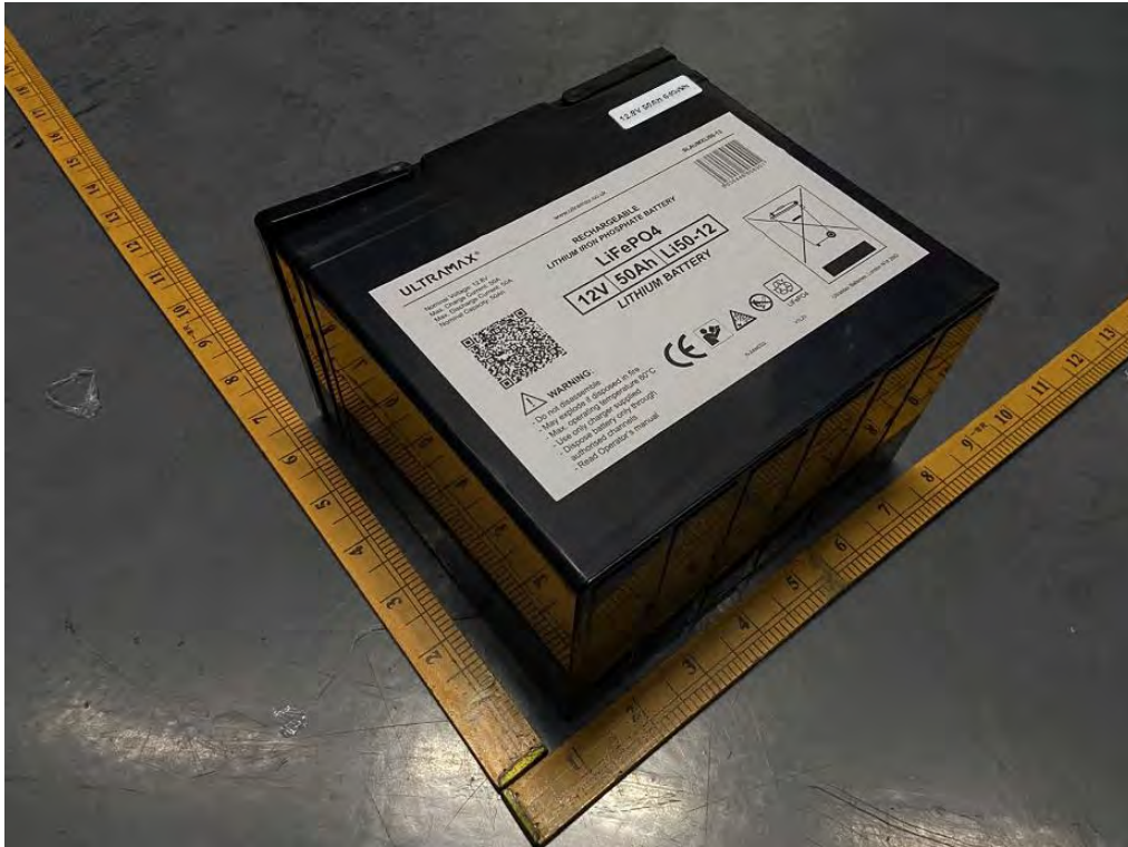
Figure 1 Overall view I of battery