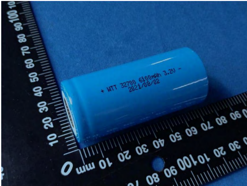
Figure 3 Overall view of cell