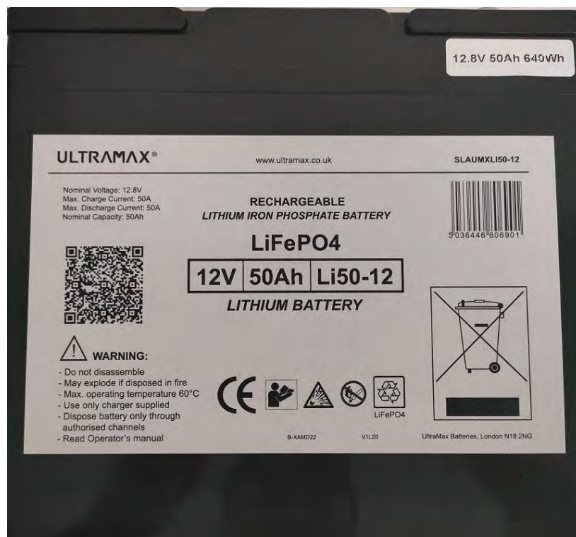
Figure 4 Battery Label