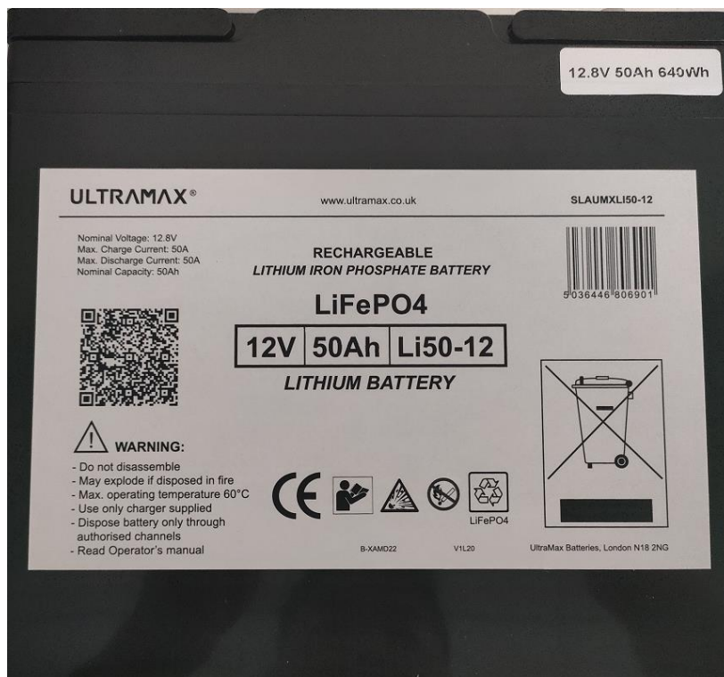
Figure 4 Battery Label