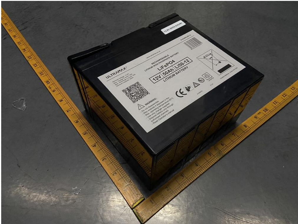
Figure 1 Overall view I of battery