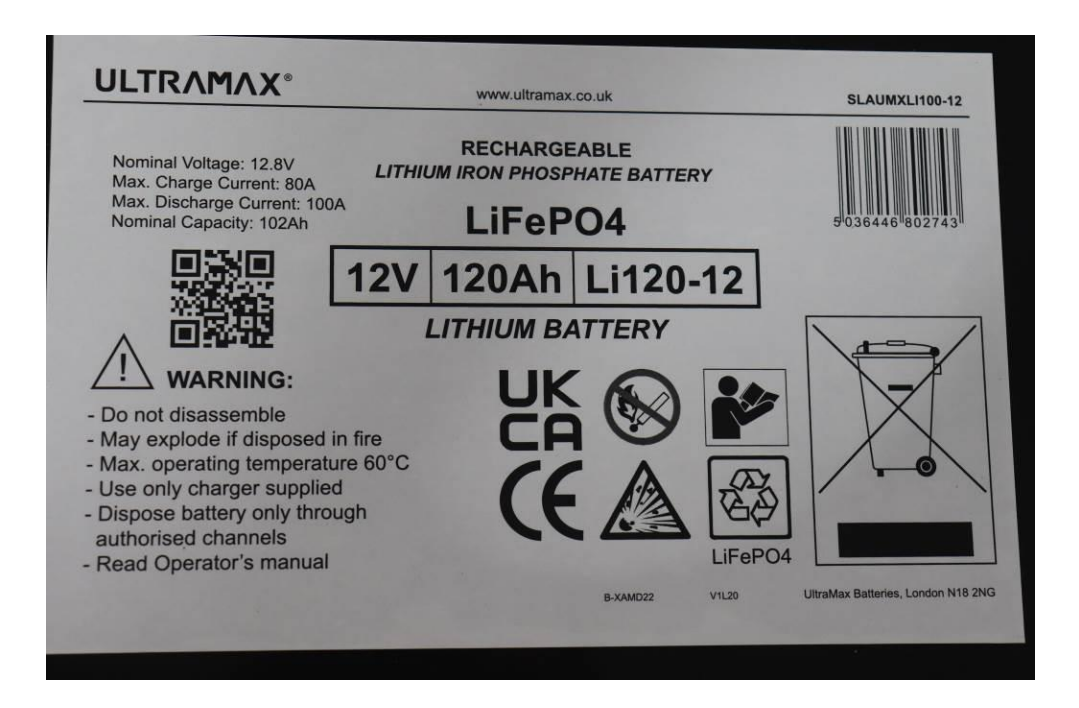
Figure 4 Battery Label