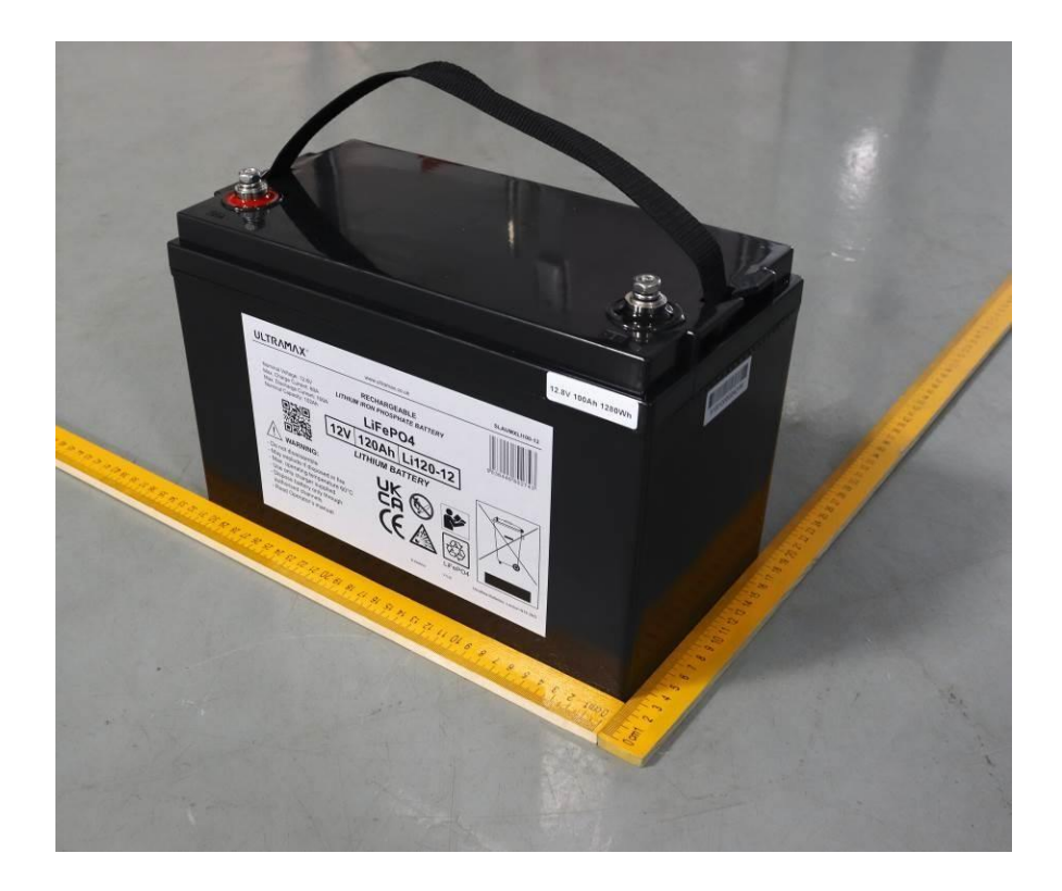
Figure 1 Overall view I of battery